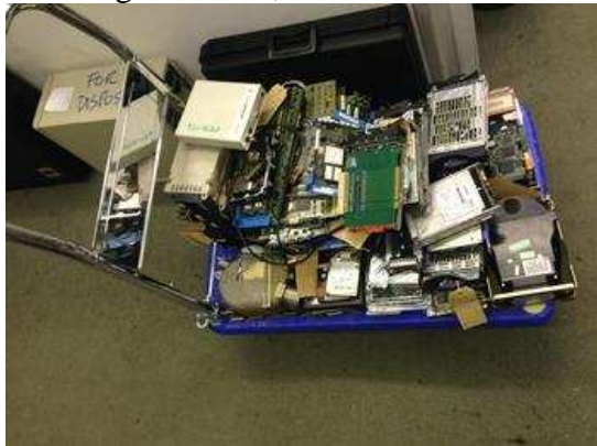
A Trolley Load of Storage

Two Hursley departments have been having a major clear out and invited us to take what we wanted. One area yielded a lot of miscellaneous hardware, software and documentation. The other, the Storage Systems Development group, yielded a quantity of SSA disk adapter cards and hard disks. We also found a prototype for the Redwing hard disk, which had two actuators, whereas the finished disk only used one.